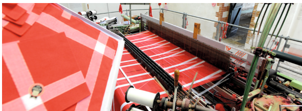
Finished handkerchiefs in front of the loom with the red and white fabric.

Cholet has been known for centuries as a centre of textile production and especially of handkerchiefs. Its chosen symbol is the Mouchoir rouge de Cholet. This can be traced back to a song from 1900 about a battle fought in 1793. The handkerchief is issued with a fitting text on special occasions. For the Tour de France time trial in 2018, Cholet even produced a yellow version.