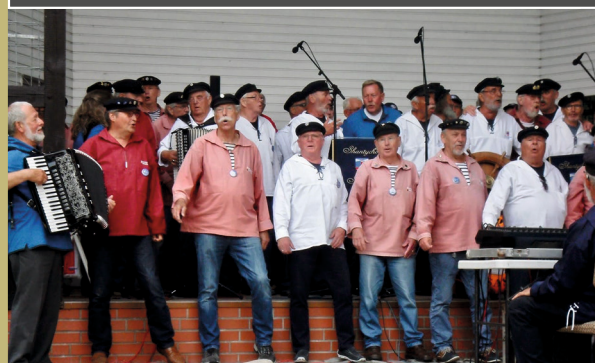
The joint concert by the shanty choirs from Sassnitz and Oldenburg.