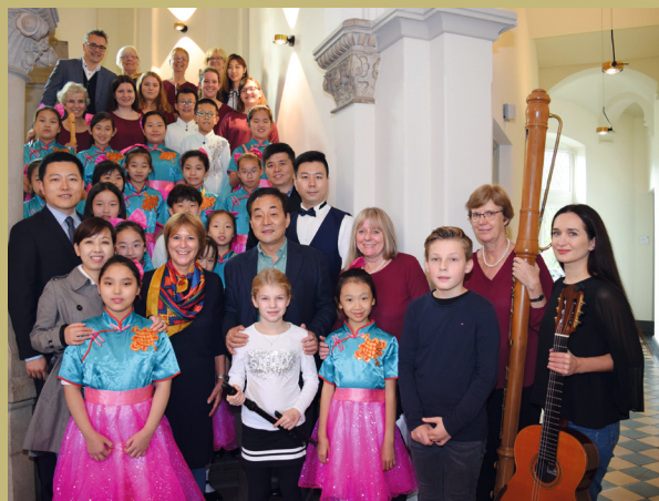
The singers from Xi'an together with the Recorder Ensemble from Heilig Music School in the Great Hall of the Town Hall.