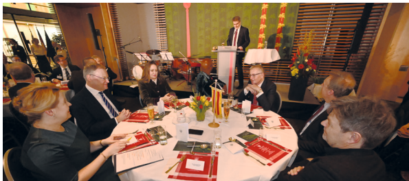
The head table with Federal Minister for Family Affairs Franziska Giffey and State Prime Minister Stephan Weil.

The annual dinner known as the "Deftig Ollnborger Gröönkohl-Äten" took place in Berlin for the 63rd time on 2 March 2020. The event held in Lower Saxony's permanent representation celebrates the region's "national dish" of kale. This year, our twin city Cholet added a very special gift to the occasion: the Mouchoir rouge de Cholet, a red handkerchief which was used instead of the usual place mats. It was printed with the courses and drinks served at the dinner. The gesture was quite a talking point among the guests.