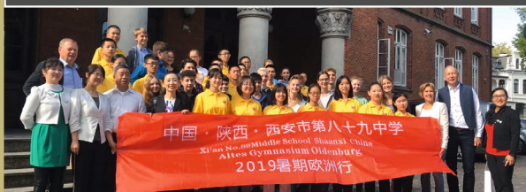
Students from the Altes Gymnasium with their guests from Xi'an Middle School No. 89.

In November 2019, the networking trade fair Promotiedagen took place in Groningen. For the first time, the No(o)rd Plein provided a joint presentation platform for the East Friesland/Papenburg region and the Ems-Dollart region and the "Oldenburg Plein" of the city's Business Development Agency and companies and institutions from Oldenburg.