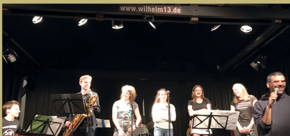
Bandshop NL speciaal in Wilhelm13.